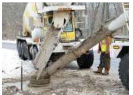
Filling old 66-inch force main with flowable concrete on White Road