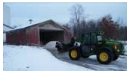
Tele-handler pushing salt into storage at grain center