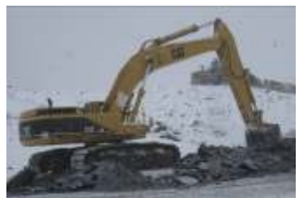
Excavator being used in the landfill